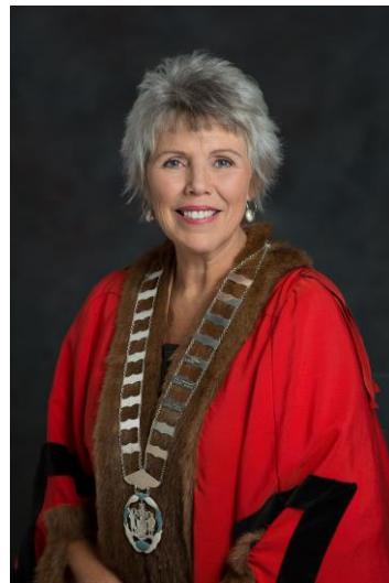
Sheryl Mai Mayor of Whangārei